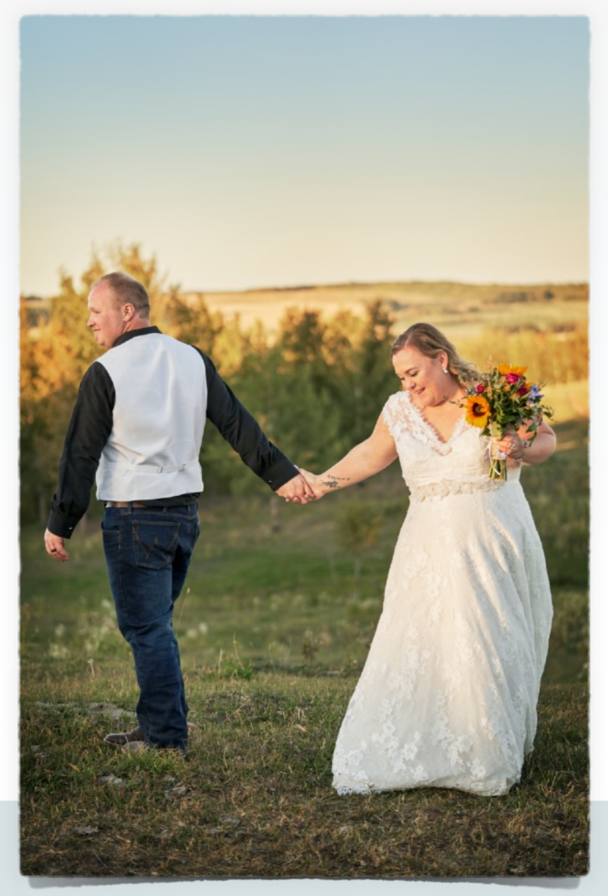
Add On Details Continued...