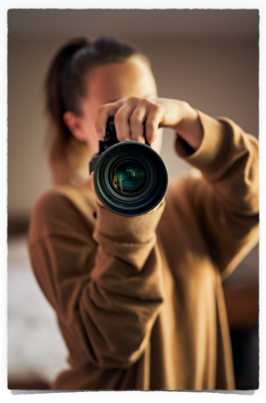
\label{eq:theory of the consider me to be a part of your wedding.} for reaching out to consider me to be a part of your wedding.